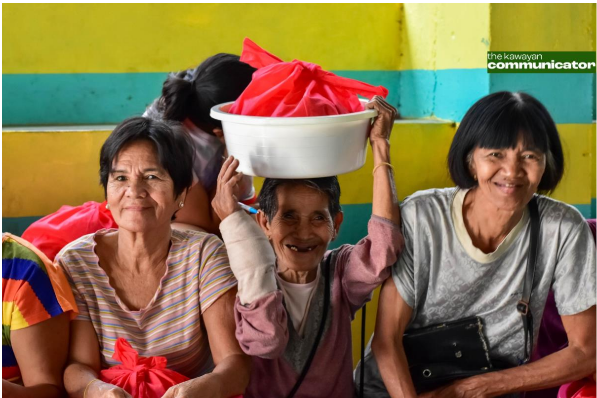
Acts of kindness, no matter how simple, remind us of the power of giving.