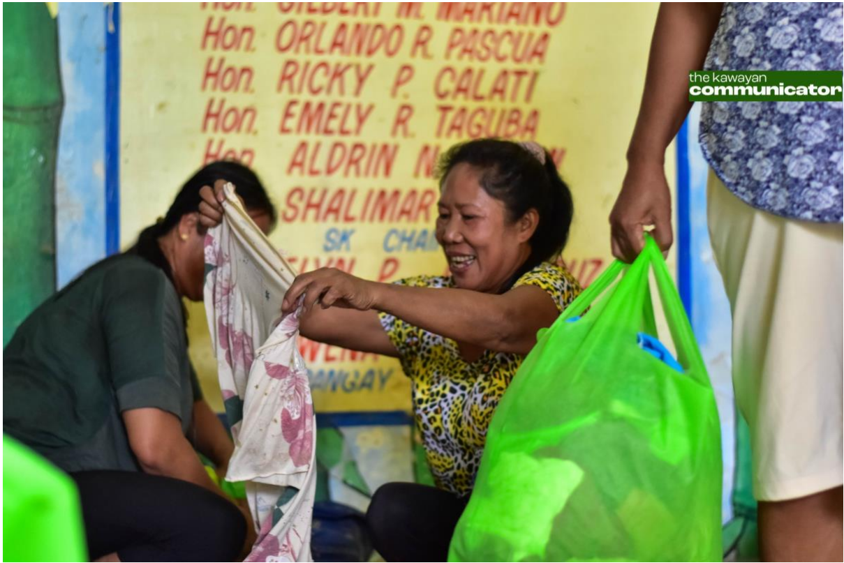
A simple gift, a heartfelt smile—proof that joy comes from the thought behind the giving.